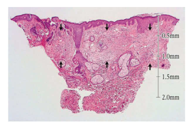
Figure 2. The histologic findings 1 month after the procedure. A decreased number of sebaceous glands and the formation of fibrosis are observed from the upper to middle dermis as indicated by arrows (hematoxylin-eosin stain; × 40 original magnification).

applied for a duration of 0.25 to 0.50 seconds at an intensity of approximately 40 W using the IME-HR 5000 electrosurgical apparatus. Generally, one needle insertion and the current application was